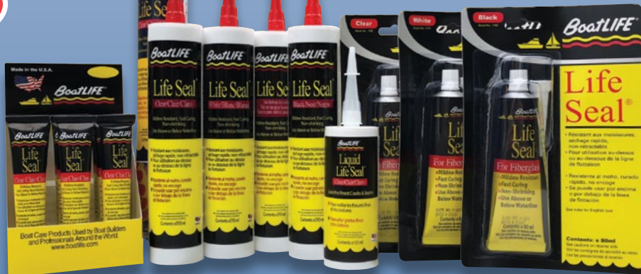
Life Seal Sealant SPEC SHEET