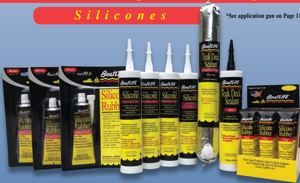
Marine Silicone Rubber Sealant SPEC SHEET